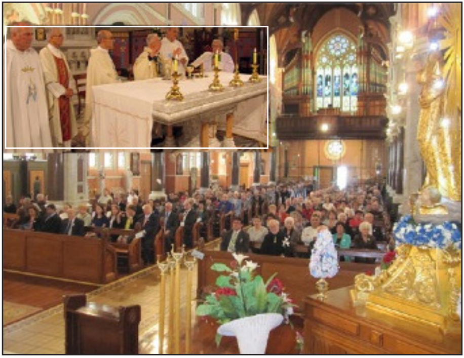
The congregation at St Mary Star of the Sea Church in West Melbourne. Inset: the priests celebrating Mass celebrating Il-Bambina

Four days later, on September 12, the group organised the Vittoria Din-