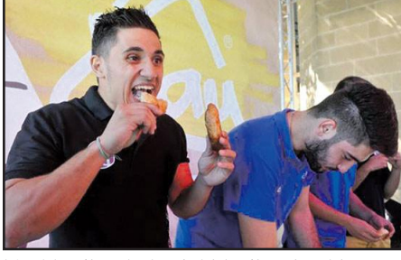
b'tobba li xebgħu jgħidu lin-nies biex ma jģejjpux u huma ma tantx jipparttikaw dak li jgħidu.