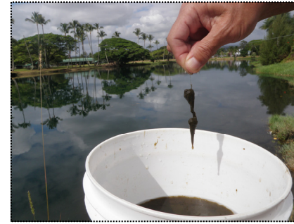
Tandem hooks baited with chain diatoms to catch 'ama'ama in Wailoa River, Hilo Hawai‘i