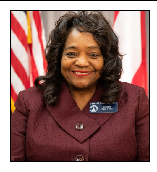
Senator Donzella James Senate District 35