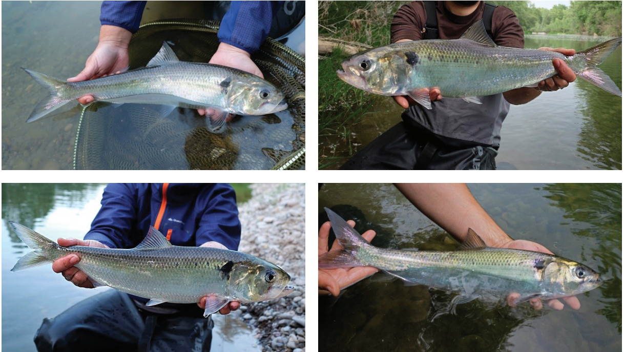
Figure 2. Adult specimens of twaite shad ( Alosa fallax ) captured by angling in the River Fluvià on May, 2015. Ejemplares adultos de saboga (Alosa fallax) pescados con caña en el río Fluvià en mayo de 2015.

other diagnostic morphological characters allowed us to identify the shad individuals captured in the Fluvià and Ter rivers as twaite shad. However, hybridization between twaite shad and allis shad has been reported over most of their historical range (Alexandrino et al. , 2006; Coscia et al. , 2010; Jolly et al. , 2012), including the Western Mediterranean (Rhône and Ebro rivers) (Andree et al. , 2011; Faria et al. , 2012; Sotelo et al. , 2014). For example, 34 % of individuals collected in a study in the Ebro presented typical allis shad mitochondrial haplotypes despite being morphologically classified as twaite shad (Sotelo et al. , 2014). Therefore, without genetic analysis, the possibility that some fish from the Fluvià are hybrid individuals is feasible and should be clarified in subsequent studies.